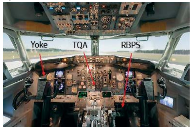
Figure 3: Pilot control stick (yoke), RBPS and TQA