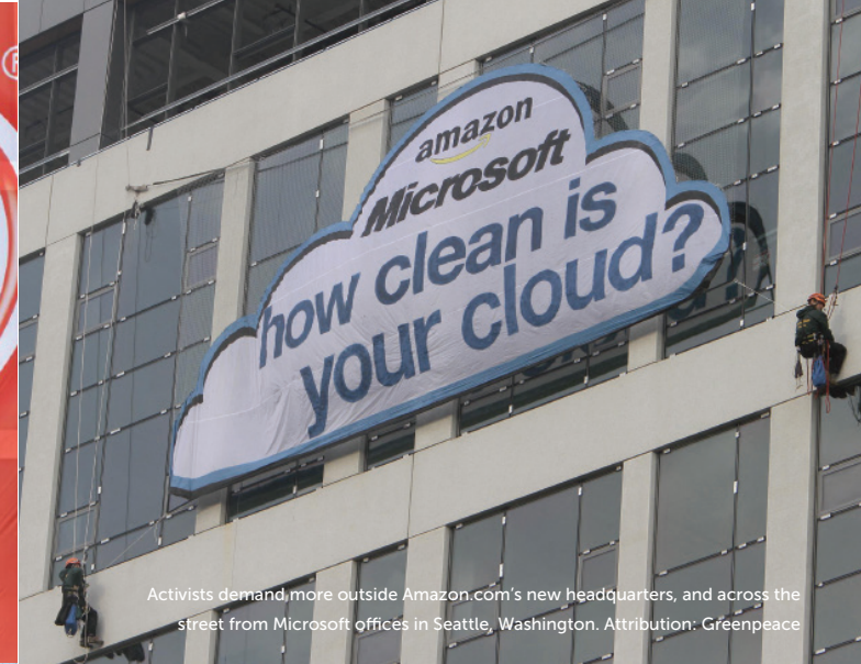
Activists demand more outside Amazon.com’s new headquarters, and across the street from Microsoft offices in Seattle, Washington.