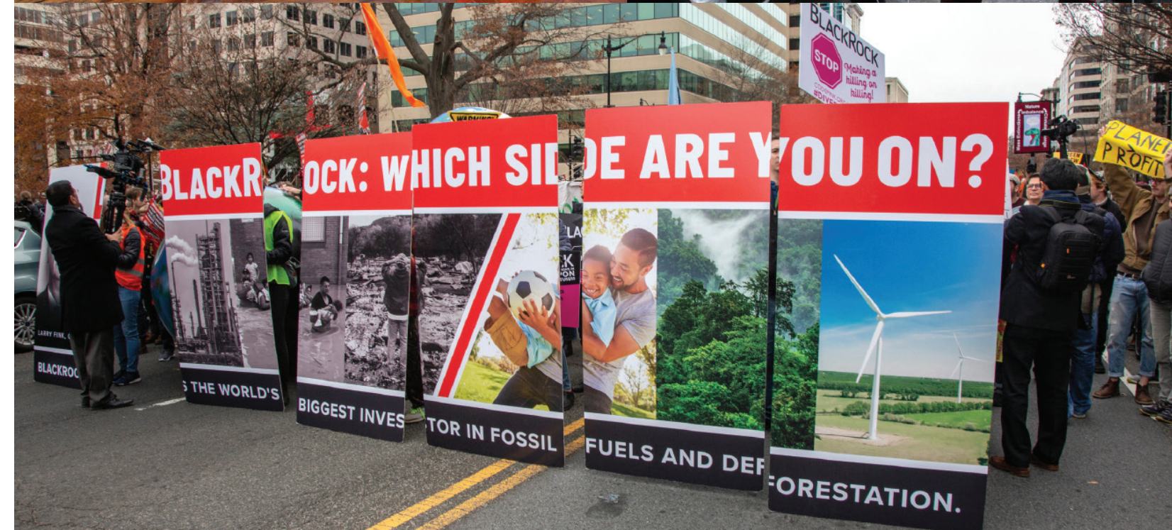
Activists in Washington, D.C. refuse to take BlackRock’s promises at face value.