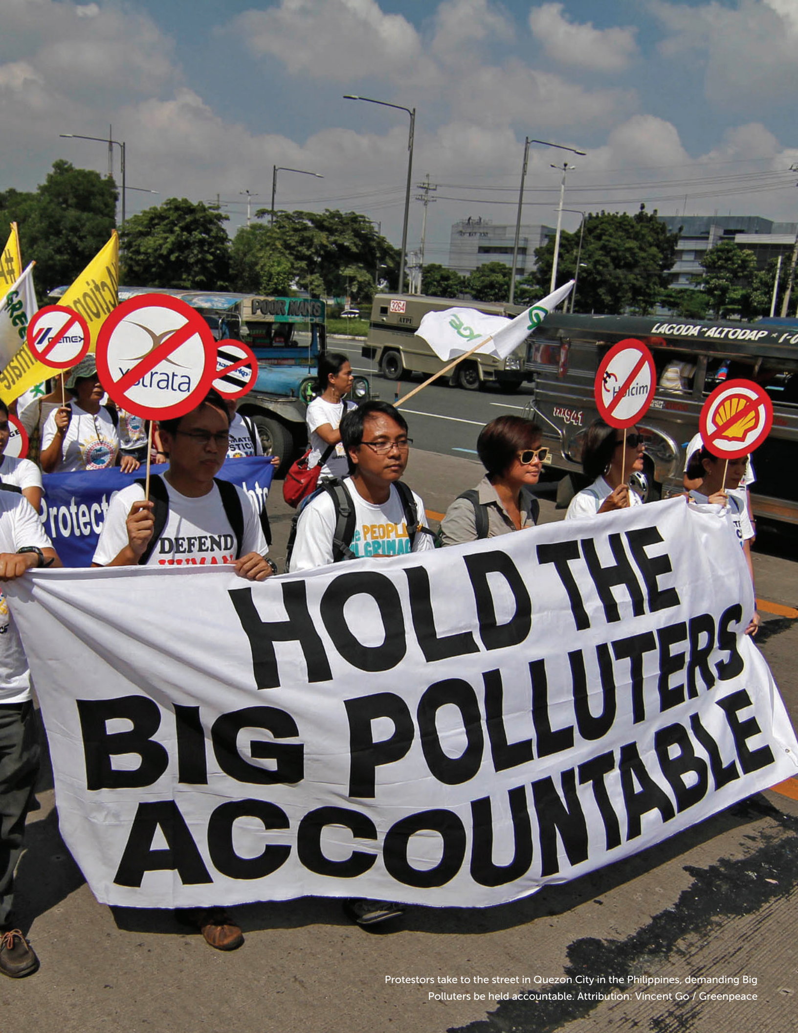
Protestors take to the street in Quezon City in the Philippines, demanding Big Polluters be held accountable.