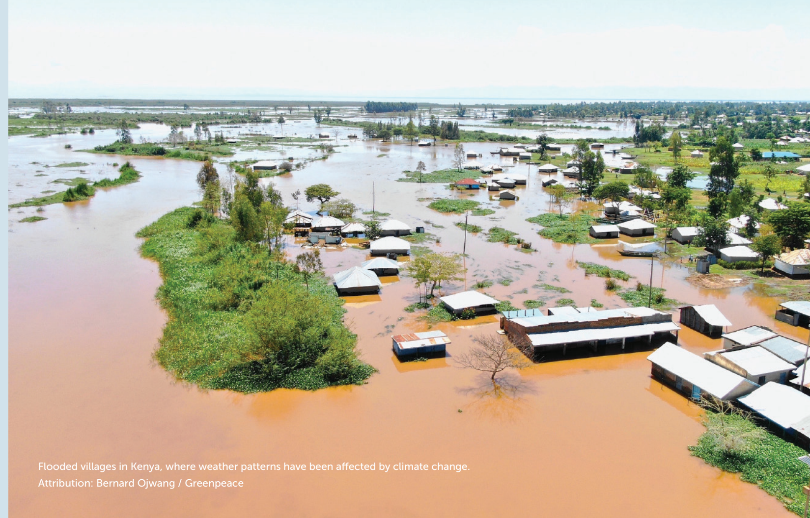
Flooded villages in Kenya, where weather patterns have been affected by climate change.

Across sectors, Big Polluters have no intention of real climate action now, or anytime soon. And as this analysis makes clear, their “net zero” promises are as empty as all the countless others they have made over the past decades and are being used to attempt to trick the public into believing that they can still supposedly be the solution to the very crisis they caused.