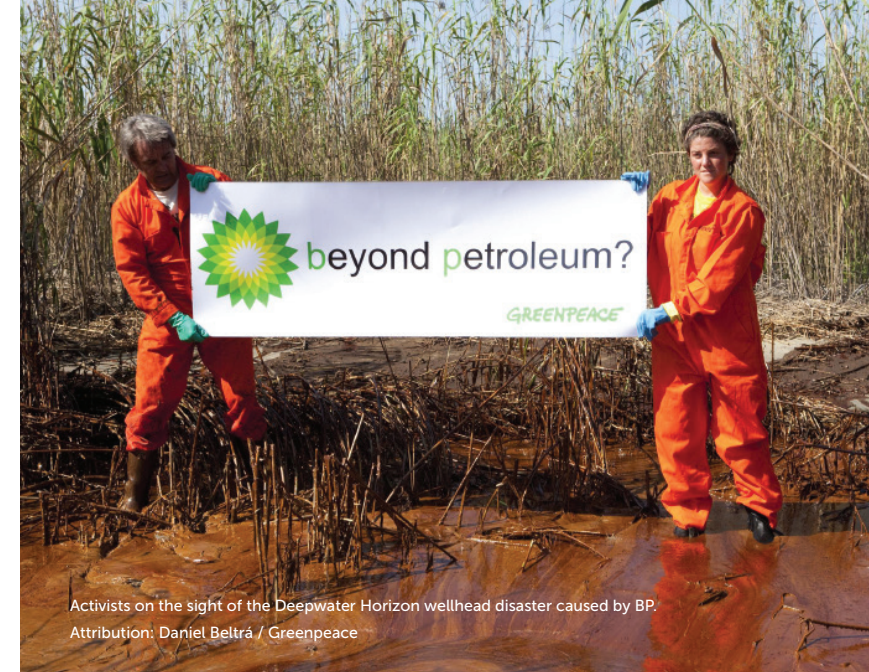
Activists on the sight of the Deepwater Horizon wellhead disaster caused by BP.