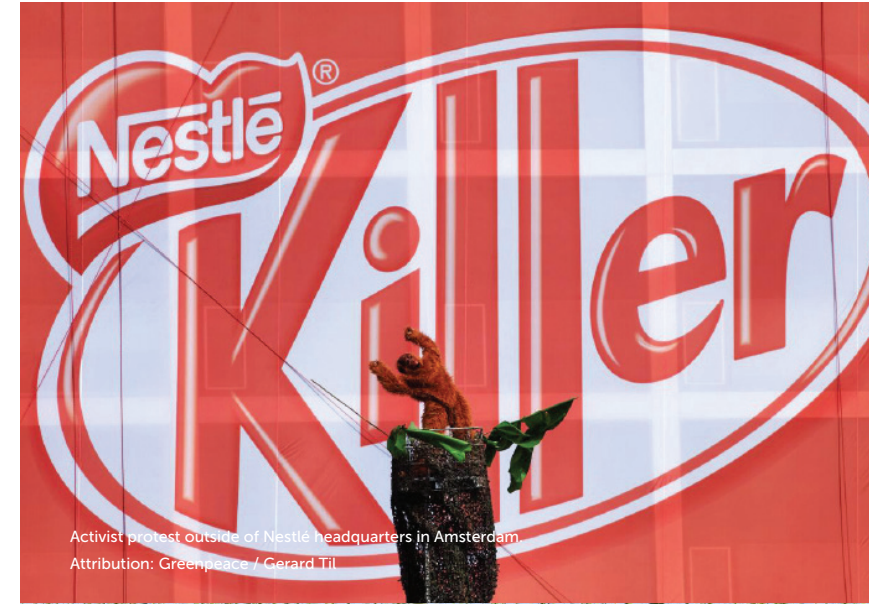
Activist protest outside of Nestlé headquarters in Amsterdam

For example, United Airlines is counting on building carbon direct air capture plants to be able to use Direct Air Capture (DAC) technology that doesn’t exist yet to literally hope to suck carbon out of the air and pump it into the ground (a process, by the way, that is intended to be used for Enhanced Oil Recovery to extract even more oil in hard-to-reach places). Walmart’s climate plan entirely overlooks Scope three emissions (meaning the emissions associated with the products it sells), a type of emissions that counts for an estimated 95 percent of its carbon footprint. Fossil gas will continue to represent 90 percent of oil major Eni’s production and it is still planning to increase oil and gas production over the coming years, a feat that the corporation proposes will be compensated for through reforestation schemes that have been criticised as fake forests. 92 93 BlackRock , the world’s largest asset manager, has pledged to reach “net zero” emissions in its portfolio by 2050. But despite pledging in 2020 to sell off most of its fossil fuel shares “in the near future”, it still owns US$85 billion in coal assets due to a “loophole” in its policy. The list of failings goes on and on and on.