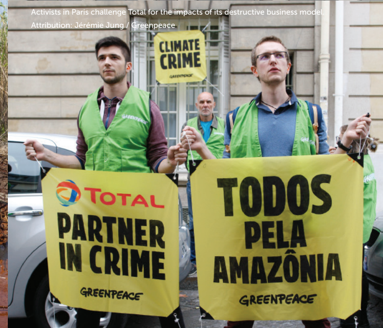
Activists in Paris challenge Total for the impacts of its destructive business model.