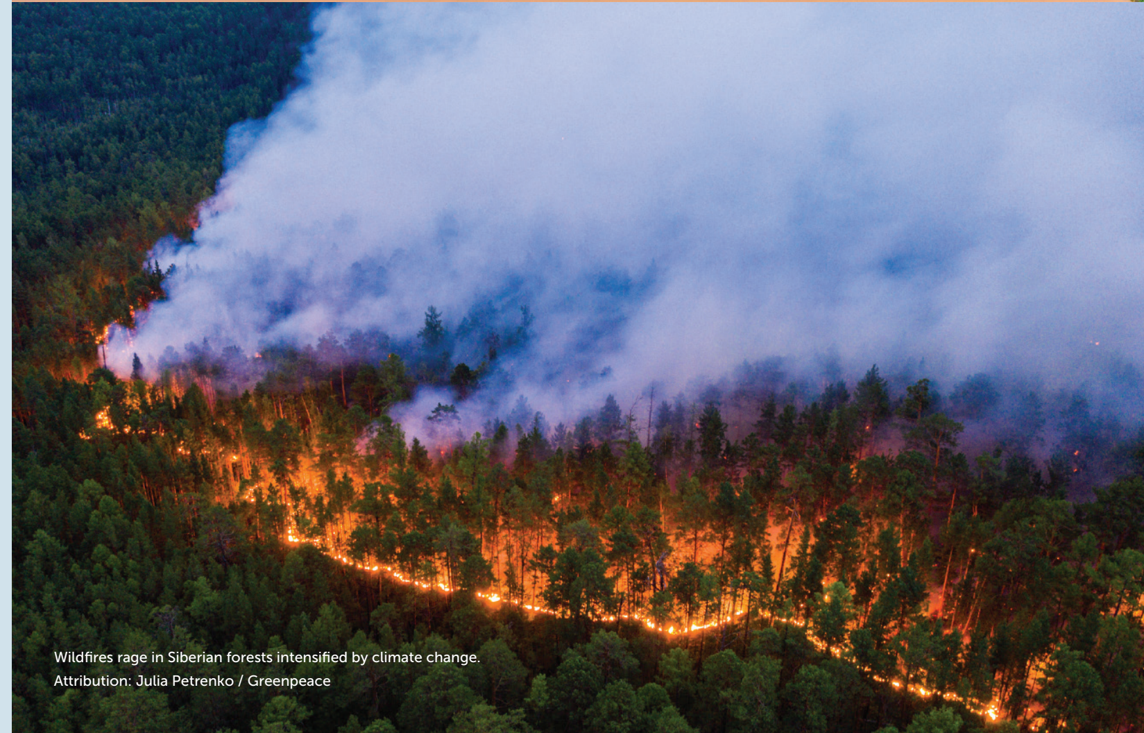
Wildfires rage in Siberian forests intensified by climate change.